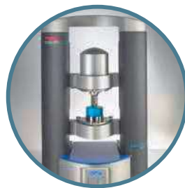
Thermo Scientific™ HAAKE™ MARS™ rheometers for advanced QC and applied R&D demands