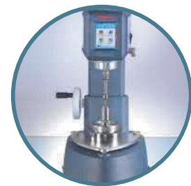
Entry level Thermo Scientific™ HAAKE™ Viscotester™ iQ, the portable rheometer for flexible QC tasks

Learn more at thermofisher.com/qcrheometers