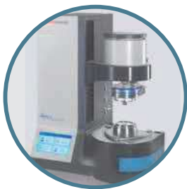
Thermo Scientific™ HAAKE™ MARS™ iQ rheometers for comprehensive QC needs

From development to quality control – reliable analyzes with versatile, innovative instruments increase your productivity and maintains quality standards. Thermo Scientific Rheometers meet these requirements: Ease of use, measurement and evaluation software for beginners and professionals, extensive accessories for every application.